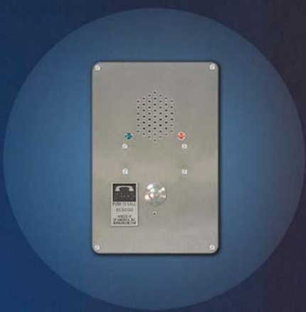
Flush Mount or C.O.P. Mount Elevator Phone