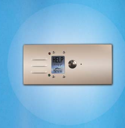
Wheelchair Lift Phone