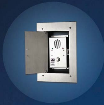
Traditional Box Style Elevator Phone