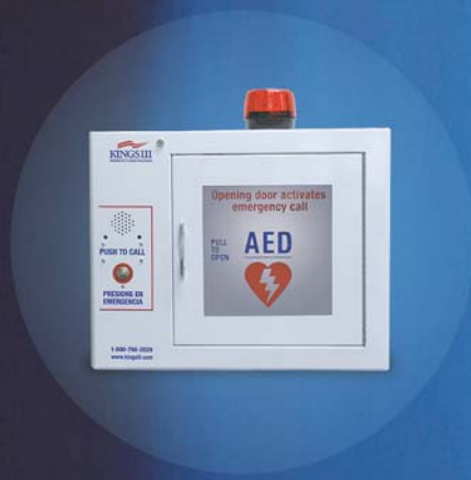
AED Cabinet with Emergency Phone