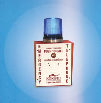
Parking and General Help Phone